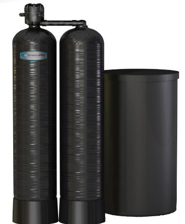
SOFTENERS: CC/ CP SERIES