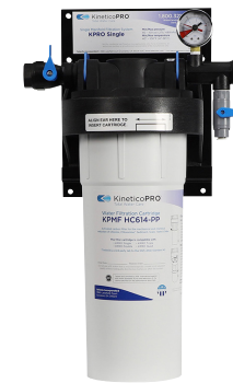
FILTERS: KPMF HC-PP

KineticoPRO has a full suite of water treatment solutions to help protect your steamers and combi-oven equipment. Our water filters help to reduce scale formation and remove disinfectants while our water softeners and reverse osmosis systems reduce water hardness and total dissolved solids. Helping to prolong the life of your equipment, reduce costly repairs, and reduce undesirable downtime.