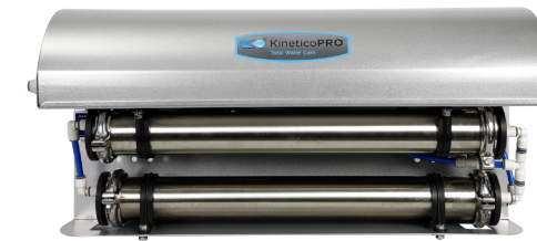
REVERSE OSMOSIS NSC/ W-SERIES