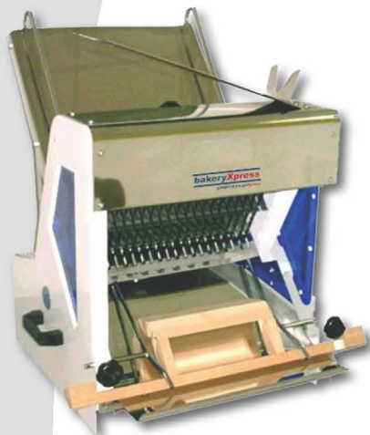
DXP-GF001 (gravity feed bread slicer)