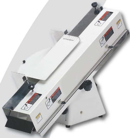
DXSM-270 (bread slicer)

The DXP-GF001 series bread slicer is a reliable high-quality table top slicer that can be used for continuous operation. Great for use in Supermarkets Bakeries, Schools, Deli's, Retail Bakeries, Sub Shops, Hospitals, Restaurants, Bagel Shops, Caterers and more!