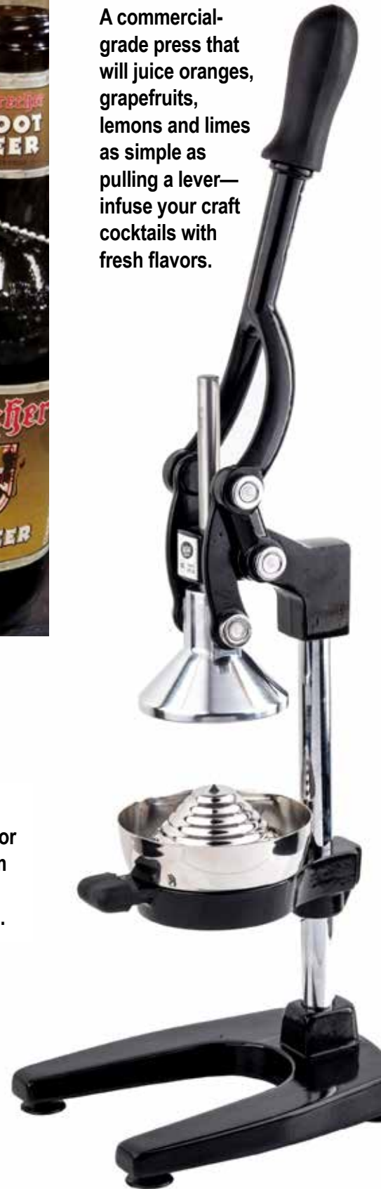
COMMERCIAL JUICE PRESS #JP9730

A commercial-grade press that will juice oranges, grapefruits, lemons and limes as simple as pulling a lever—infuse your craft cocktails with fresh flavors.