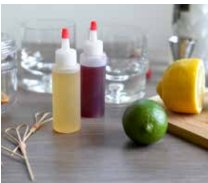
CHEF'S SQUEEZE BOTTLES #1102