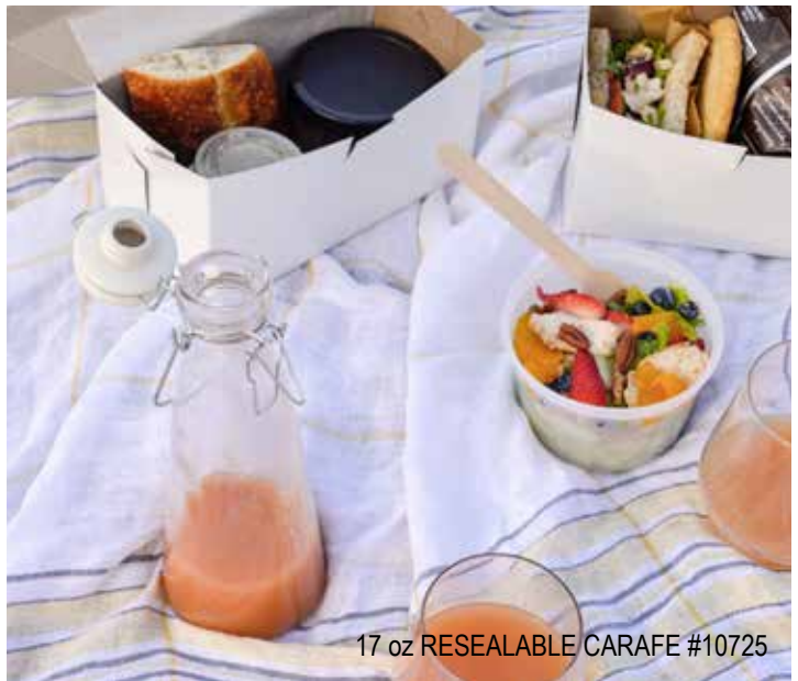
17 oz RESEALABLE CARAFE #10725