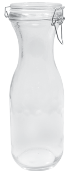
RESEALABLE GLASS CARAFE #RGC34 (34 oz)