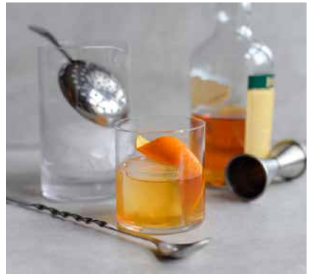
Provide your patrons with the option to purchase essential bar tools with your kits. Shown here: 11" Bar Spoon #501K, Julep Strainer #S211, Japanese Style Jigger #JJ1205.