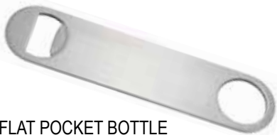
FLAT POCKET BOTTLE OPENER #H3996