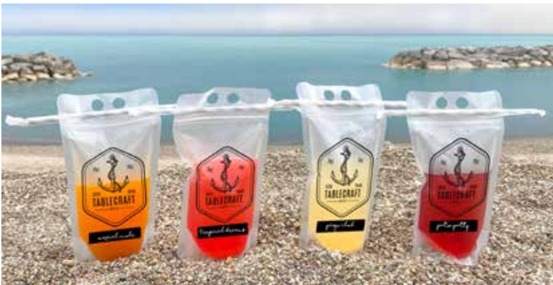
Serve prebatched cocktails in pouches—because they're fun and who doesn't want to feel like a kid again! Available in 10 oz (#10681), 16 oz (#10682), and 32 oz (#10683). Custom imprinting available, contact a TableCraft representative for a quote.