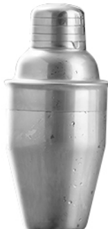
PREMIUM 3-PIECE S/S BAR SHAKER (6 oz) #276