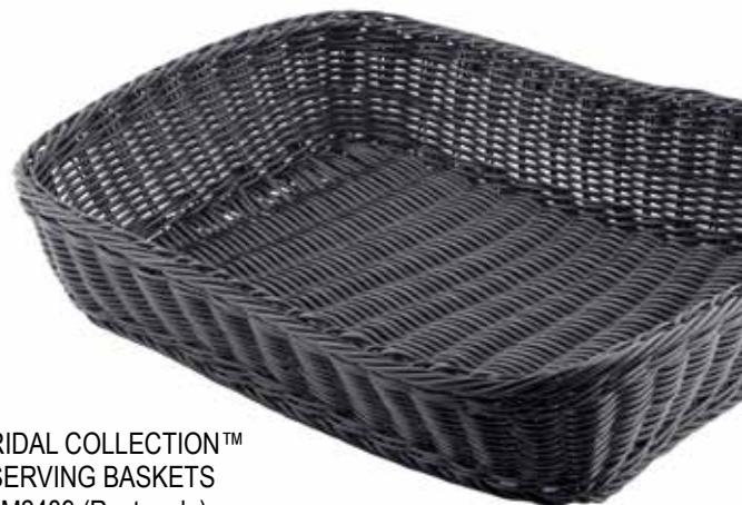
RIDAL COLLECTION™ SERVING BASKETS #M2489 (Rectangle) #M2474 (Oval)