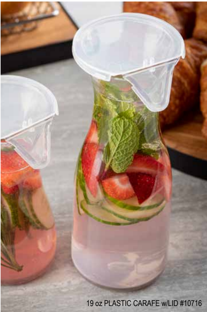
19 oz PLASTIC CARAFE w/LID #10716