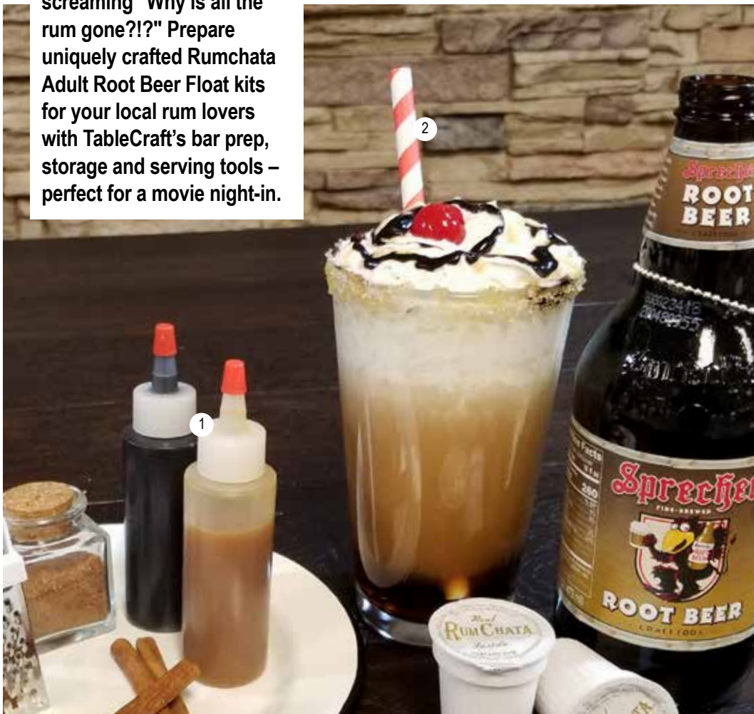
1 CHEF'S SQUEEZE BOTTLES #1104 2 ECO-FRIENDLY PAPER STRAW (INDIVIDUALLY WRAPPED) #100125

Don't leave your patrons screaming "Why is all the rum gone?!?" Prepare uniquely crafted Rumchata Adult Root Beer Float kits for your local rum lovers with TableCraft's bar prep, storage and serving tools – perfect for a movie night-in.