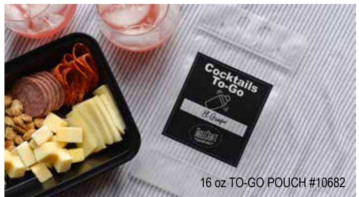
16 oz TO-GO POUCH #10682