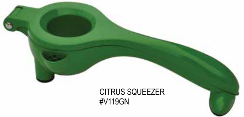
CITRUS SQUEEZER #V119GN