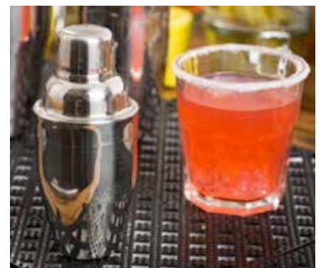
6 OZ 3-PIECE BAR SHAKER #276