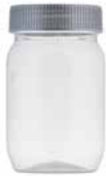
PLASTIC MASON JAR #10858 (8 oz) #10859 (16 oz) #10860 (32 oz)