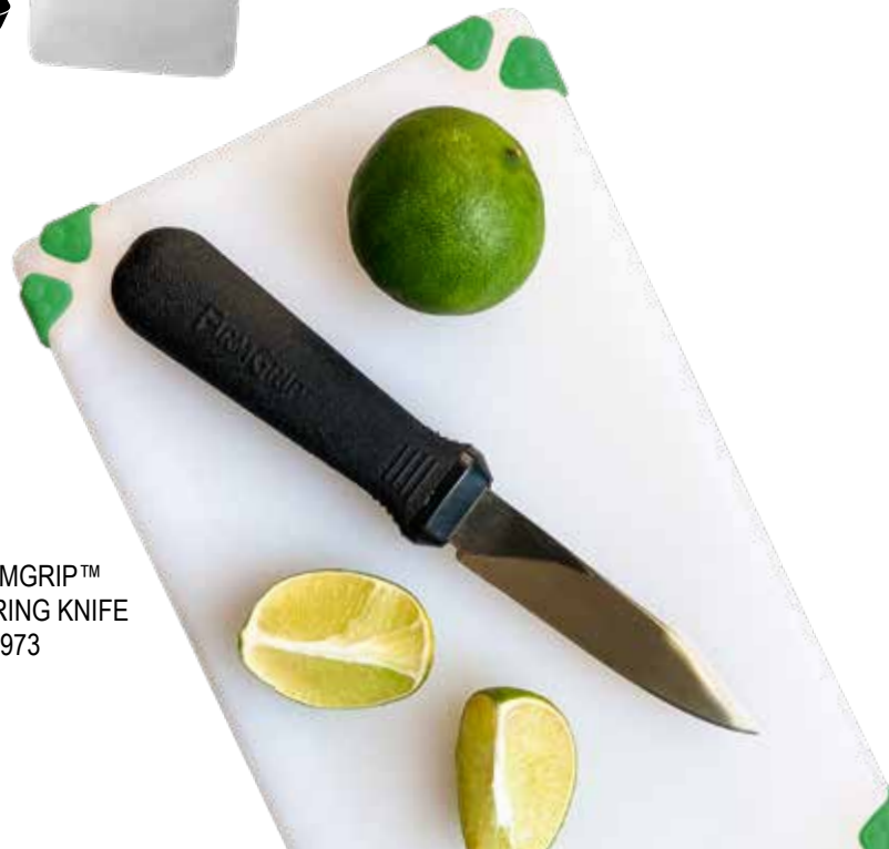
FIRMGRIP™ PARING KNIFE #10973