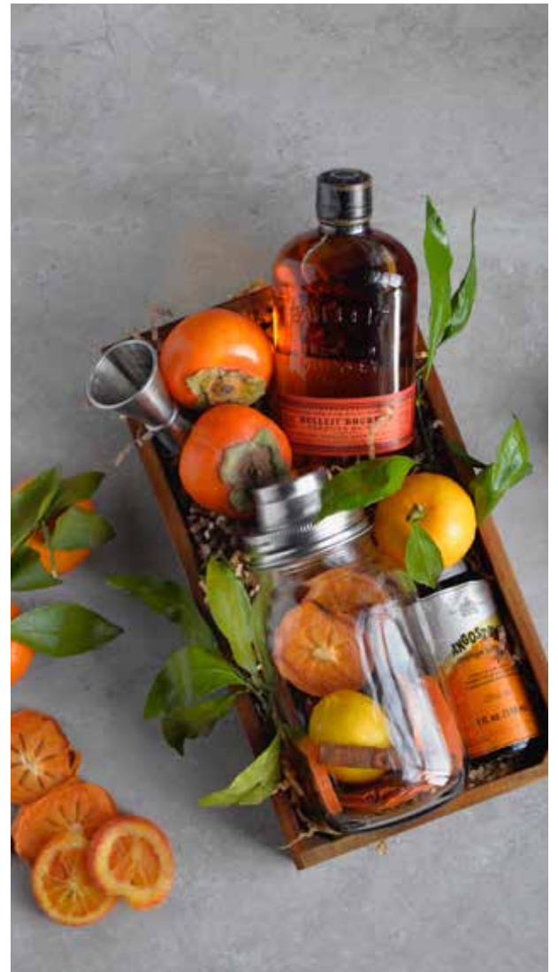
Bring the craft cocktails experience to the comfort of your patrons' homes with cocktail to-go kits. We have a variety of crates and baskets to hold all your ingredients. Shown here: Acacia Wood Crate #CRATE14