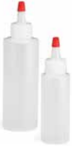
CHEF'S SQUEEZE BOTTLES #1102 (2 oz) #1104 (4 oz)