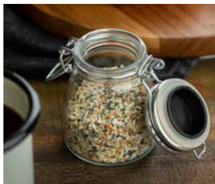
2 OZ RESEALABLE SHAKER #H2S&P