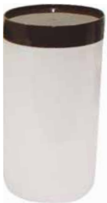
1 QT BACKUP #JC1032A