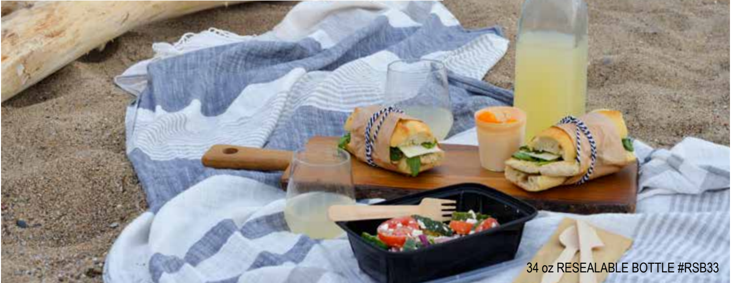
34 oz RESEALABLE BOTTLE #RSB33

From drink pouches, glass bottles to plastic containers, we have the assortment of products to help the operator get creative with to-go beverages.