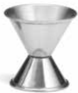
CLASSIC STYLE JIGGER #1202