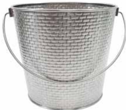
BRICKHOUSE COLLECTION™ STAINLESS STEEL 8" PAIL #GTSS87