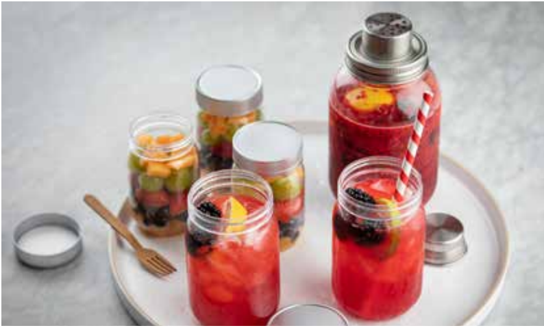
Our Plastic Mason Jars are great for gathering all of the ingredients needed for take and make cocktail at home! Plastic Mason Jars available in 10 oz (#10858), 16 oz (#10859), and 32 oz (#10860).

As we continue to socially distance to protect our communities, TableCraft's wide array of products can help your bar or restaurant deliver favorite batched cocktails, cocktail kits, beer, and craft ingredients.