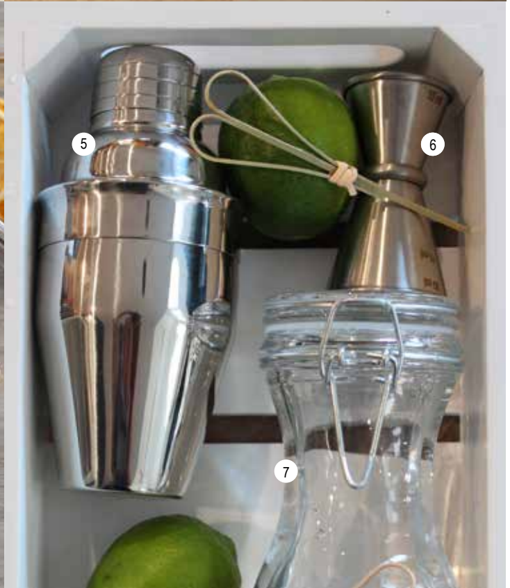
1 GASTRONORM DISPLAY CRATE #CRATE14 | 2 CLASSIC STYLE JIGGER #1202 | 3 FLAT POCKET BOTTLE OPENER #H3996 4 LOOPED & HEART PICK #BAMH45 | 5 PREMIUM 3-PIECE S/S BAR SHAKER, 6 OZ #276 6 JAPANESE STYLE JIGGER #JJ1202 | 7 RESEALABLE GLASS CARAFE #RGC34