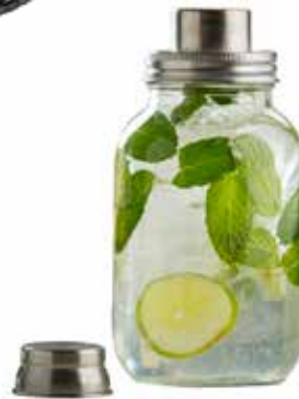
MASON JAR COCKTAIL SHAKER # MJS14 (14 oz) #MJS30 (30 oz)