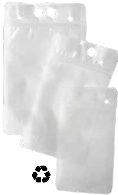
TO-GO POUCHES #10681 (10 oz) #10682 (16 oz) #10683 (32 oz) Cash & Carry: #10883 (10 oz, 50 pk) #10884 (16 oz, 50 pk)