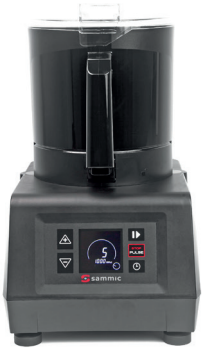
Food Processor Emulsifier