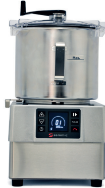
Food Processor Emulsifier