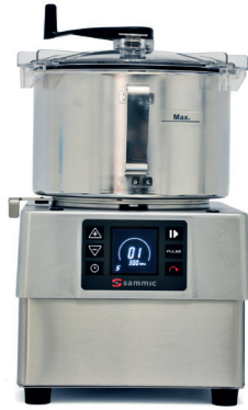
Food Processor Emulsifier