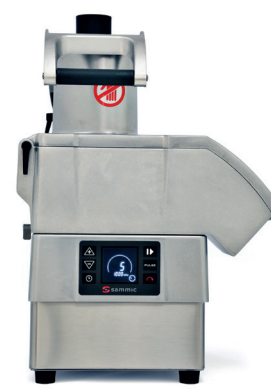
Food Processor CA-3V