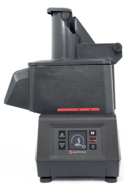
Food Processor CA-2V