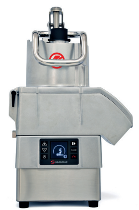
Food Processor CA-4V

CK Combi models available (emulsifier + veg slicer).