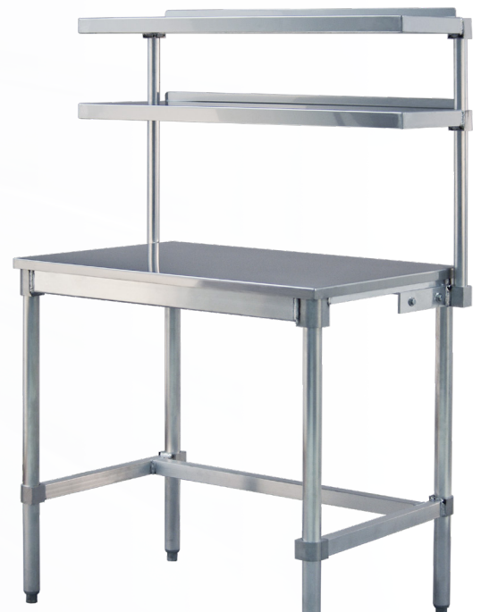
Stainless Top Table with Aluminum Cantilever Overshelves

Drawer Comes standard with the DWG50569. Optional for Standard Tables.