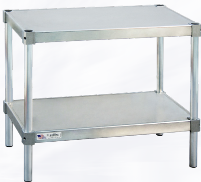
Modular Equipment Stand - Adjustable