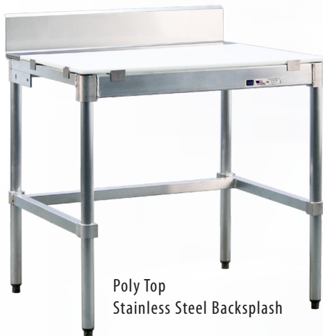
Poly Top Stainless Steel Backsplash

Several options are available... You can even make it mobile with the addition of four, 5" braking casters. Design one to meet your individual needs.