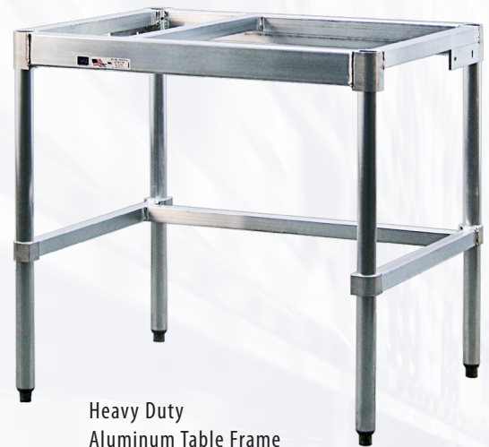
Heavy Duty Aluminum Table Frame