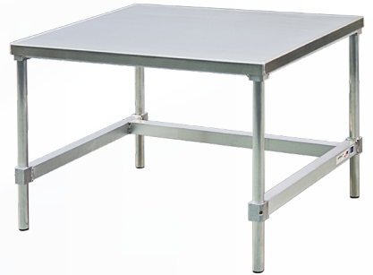
Modular Equipment Stands - Standard, Adjustable

Several options are available... You can even make some models mobile with the addition of four, 5" braking casters. Design one to meet your individual needs.