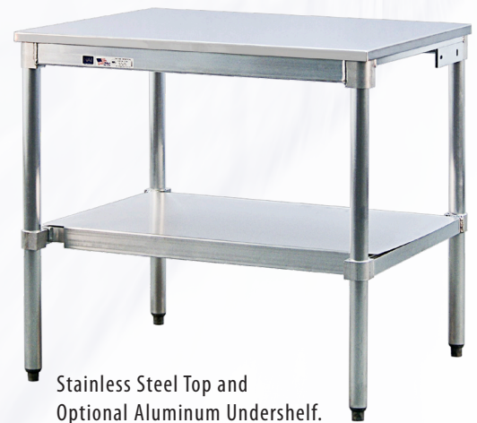
Stainless Steel Top and Optional Aluminum Undershelf.

Our Work Tables are constructed of heavy duty, lightweight aluminum; Minimizing clean-up time and guaranteed to never rust or corrode.