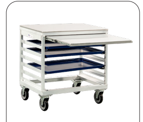
99217 | Slicer Stand