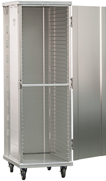
1290 | Enclosed Cabinet