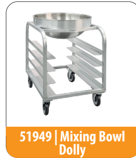
51949 | Mixing Bowl Dolly