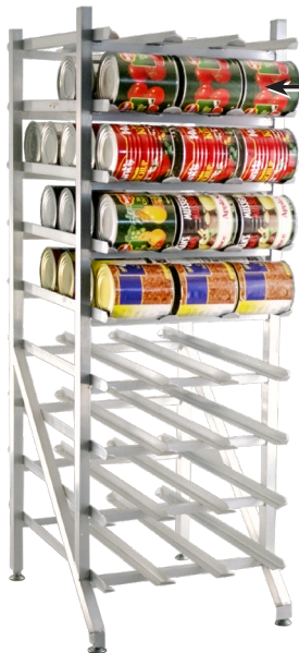
1250 | Can Rack