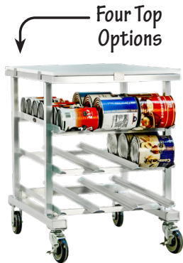
1237 | Can Rack - Poly Top Counter Height