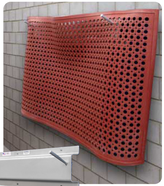
52677 | Wall Mount Rack

These all-aluminum units carry a Lifetime Guarantee against rust and corrosion.