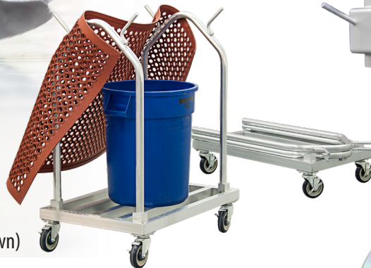
51087 | Mat Cart (Knocked Down)