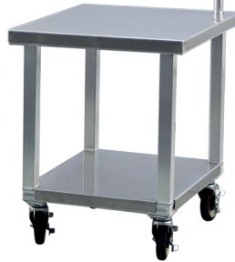
99738 | Mixer Stand