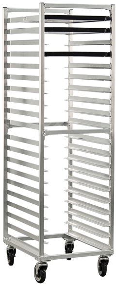
1331 | Bun Sheet Pan Rack