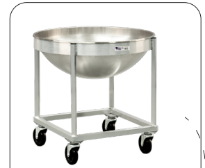
98716 | Bowl Dolly