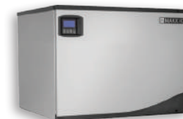
MIM370N / MIM370NH MIM500N / MIM500NH