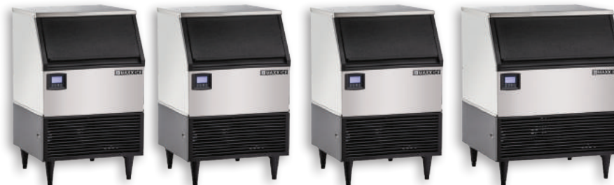
MIM150N / MIM150NH