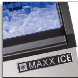
Self-Contained Ice Machine