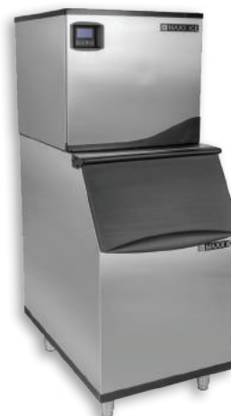
MIM360 ON MIB310N BIN