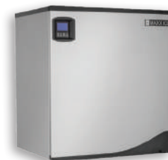
MIM1000N / MIM1000NH