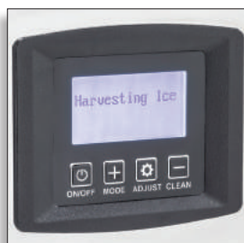
Digital Controller Display