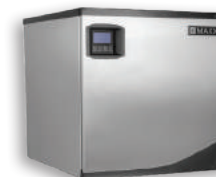
MIM360N / MIM360NH