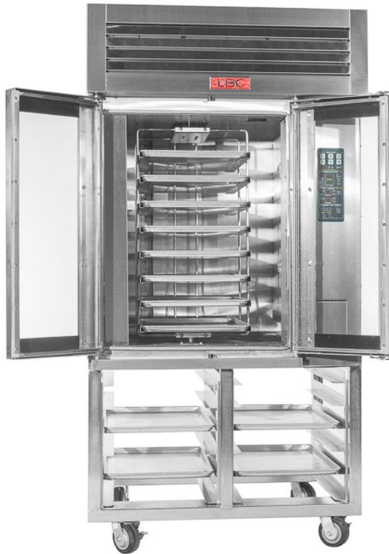
LMO-E (shown with 8-pan rack and optional 29" Stand)