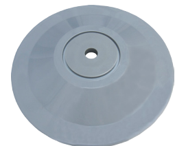
RB-10 Revolving Bumpers (per set)