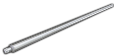
PT Post Only w/ Caps & Bullet Feet