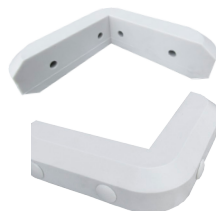
CBM-20 Corner Bumpers (per set)