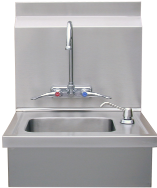
WS-2S Shown w/ Standard Faucet & Soap Dispenser