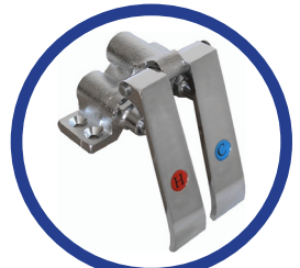
Double Knee Valve (KNV)

See Price Book Page 66-68 for all options