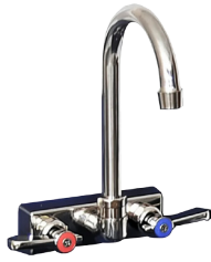
RGLH-S Splash Mounted 4" OC Gooseneck Faucet w/ Wrist Handles