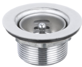
HSS-T Hand Sink Strainer