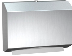
TD-L Wall/Backsplash Mounted Mini Towel Dispenser. Holds (275) Multi-Fold or (200) C-Fold Paper Towels. Includes Lock & Key.

➤ Use w/ Any Sink ➤ Overall Size: 11" x 8" x 4"