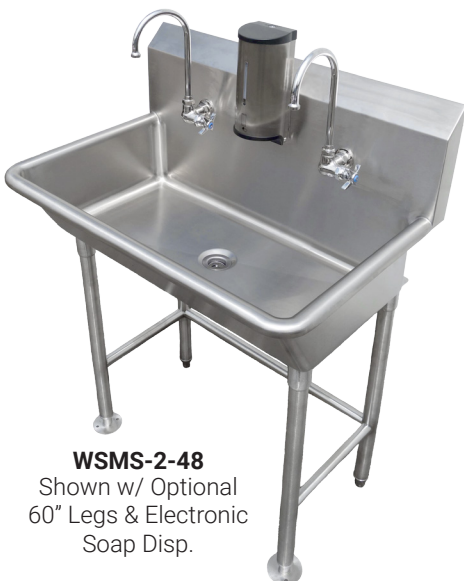
WSMS-2-48 Shown w/ Optional 60" Legs & Electronic Soap Disp.