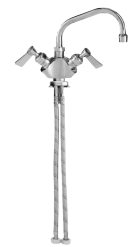
CMS Faucet Single Deck Dual Lever Handle 6" Swing Spout. 2.20 GPM Aerator @ 80 PSI