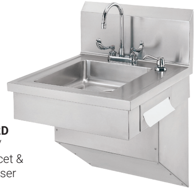
ADA-WS-2D Shown w/ Standard Faucet & Soap Dispenser