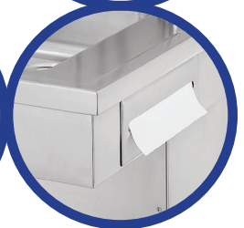
Integral Towel Disp. (ITD)