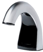
ESD Deck Mounted Electronic Soap Dispenser