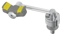
EW-U Universal Mounted Eye Wash Station. Mount in Place of ITD.