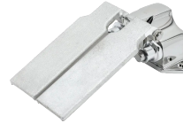
KNV-2 Double Knee Valve & Gooseneck Spout