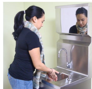
TD-M Mirrored Towel Dispenser. Includes Lock & Key.

➤ Not for Institutional Sinks. ➤ Overall Size: 19¼" x 14" x 4"