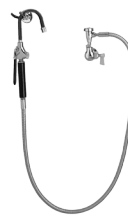
CMS Pot Filler Includes Pot Filler Valve, Vacuum Breaker & 3-Ply Hydraulic Hose