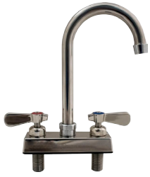
RGLH-D Deck Mounted 4" OC Gooseneck Faucet w/ Wrist Handles