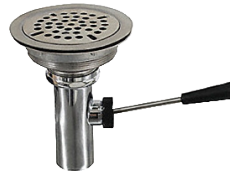
LD-2 Lever Drain

▶ Changes Drain Size to 3 1/2" ID ▶ Voids ADA Compliance