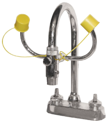
EW-S Faucet Mounted Eye Wash Station. Use with Standard Faucet Only.