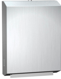
TD-B Wall/Backsplash Mounted Towel Dispenser. Holds (525) Multi-Fold or (400) C-Fold Paper Towels. Includes Lock & Key.