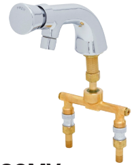
SCMV Deck Mounted Security Faucet w/ Metering Valve