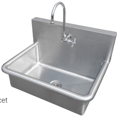
SCB-1 Shown w/ Standard Faucet