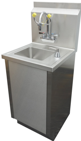
HS Shown w/ Optional (EW-S) Eye Wash Faucet