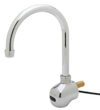
EFD-1SG Single Hole Electronic Splash Mounted Gooseneck Faucet