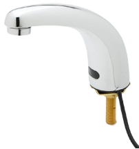
EFD-1D Single Hole Electronic Deck Mounted Integral Spout Faucet