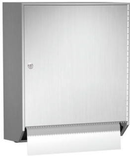
TD-AR Wall Mounted Automatic Towel Dispenser. No-Touch Unit. Holds (1) 8" Wide Towel Roll Up to 800ft. Includes Lock & Key.