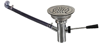
LDO-2 Lever Drain w/ Overflow

▶ Changes Drain Size to 3 1/2" ID ▶ Voids ADA Compliance