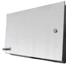
ITSD Integrated Combination Towel & Soap Dispenser. Unit To Be Wall Mounted Above IMC/ Teddy Hand Sink. Includes Lock & Key.