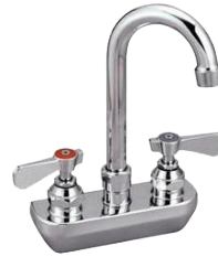
RGSH-S Splash Mounted 4" OC Gooseneck Faucet w/ Lever Handles