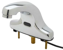
EFD-2D 4" OC Electronic Deck Mounted Integral Spout Faucet

*Upgrade RGLH faucet to equal T&S, Fisher or Chicago - specify model #.