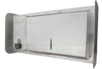
ITSD-2 Soap & Towel Dispenser. Unit to Be Mounted above any IMC/Teddy Sink. Includes Lock & Key.