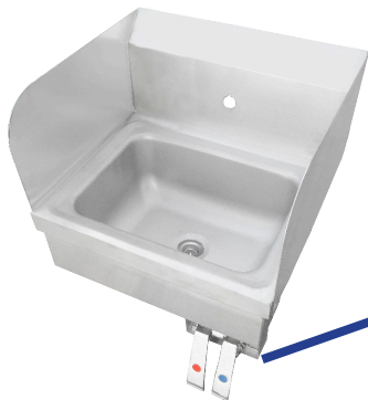
Model #CSW-1S-SSX Shown w/ Side Splashes & Knee Valve

See pages 8-10 for a complete list of hands-free accessories.