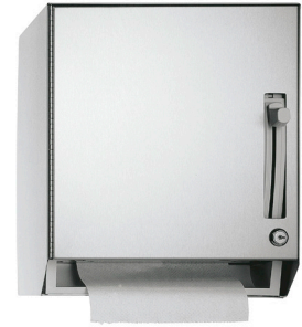
TD-R Wall Mounted Roll Towel Dispenser. Holds (1) 8" or 9" Wide Towel Roll Up to 800 ft. Includes Lock & Key.

➤ Use w/ Any Sink ➤ Overall Size: 11" x 8" x 4"