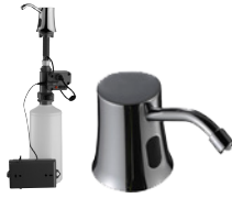
SD-E Deck Mounted Electronic Soap Dispenser