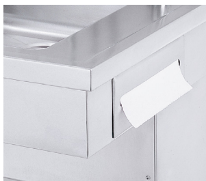
ITD Integrated Towel Dispenser Built Into Apron Of Hand Sink.