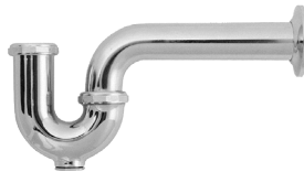
T "P" Trap