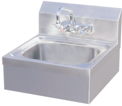
CSW-2S Shown w/ Standard Faucet