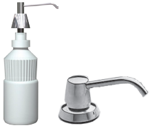
SD Deck Mounted Integral Soap Dispenser