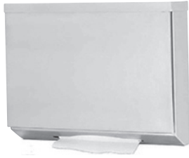
TD Wall/Backsplash Mounted Towel Dispenser.