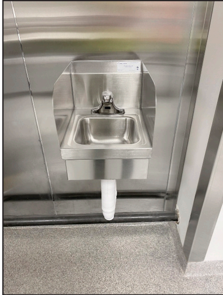
Model #CSW w/ Side Splashes & EFD-2D Electronic Faucet