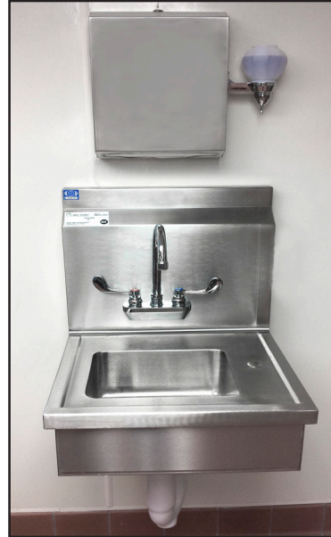
Model #WS-2S w/ CTSD