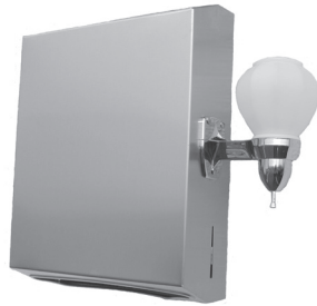
CTSD Wall Mounted Combination Towel & Soap Dispenser. Includes Lock & Key.