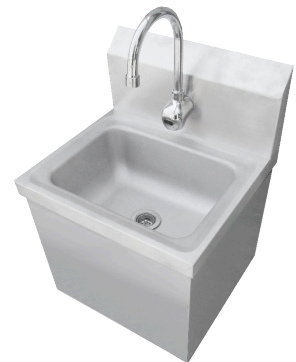
Model #CSW-1S-Shown w/ Long Apron & EFD-1SG Electronic Faucet