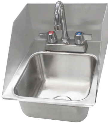
DIS-5-SS Shown w/ Faucet & Side Splashes