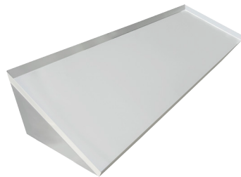
RSW Wall Mounted Rack Shelf