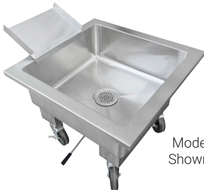
Model #UCS-SM8 Shown w/ Optional Chute