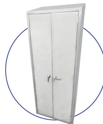
Model #SC-1830HS Shown w/ Solid Double Doors