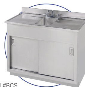
Model #BCS Shown w/ Optional Sink, Faucet & Backsplash