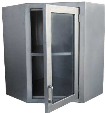
OC-CWG Shown w/ Sloped Top & Hinged Glass Door