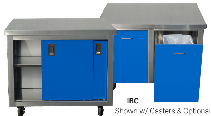
IBC Shown w/ Casters & Optional Blue Laminate Panels