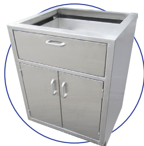
Model #BCH-2426 Shown w/o Countertop & Optional Drawer