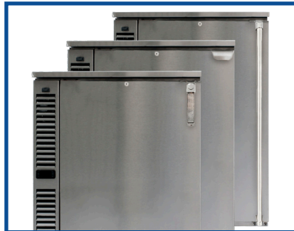
Signature, Pull-Tab, or Tube