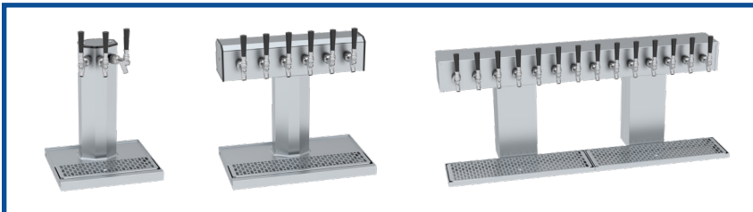
Column, Tee, or Bridge Tower