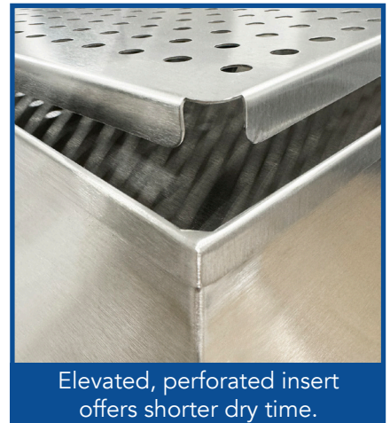
Elevated, perforated insert offers shorter dry time.