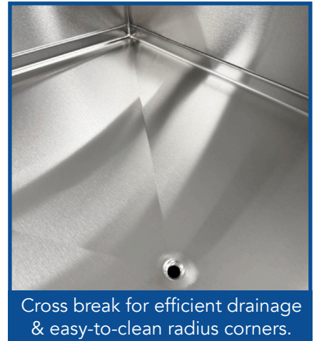
Cross break for efficient drainage & easy-to-clean radius corners.