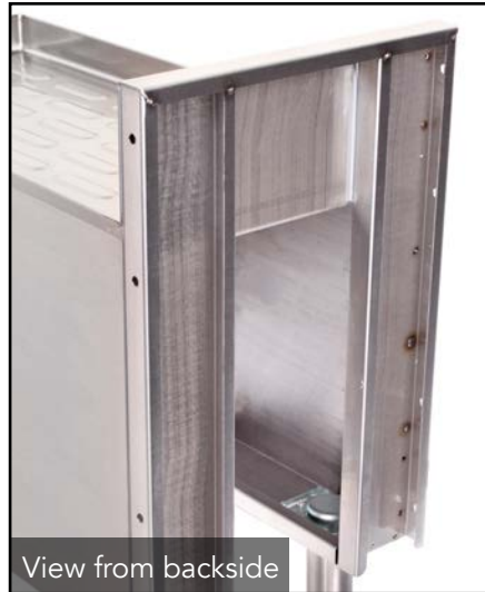
View from backside

Welded construction with bolt-on legs. Leg tubes set into recessed sockets for added strength.