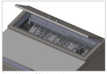
View of fans on CPA43 model

Prior to factory shipping, all models are performance-run tested for a minimum of 12 hours, providing a highly sophisticated temperature analysis recording, exclusive to each individual cabinet. This recording is then supplied, along with the unit's operation manual, for the customer. A final leak test, vibration check, noise level and visual examination is made by our quality control team, to assure a superior product is shipped from our factory.