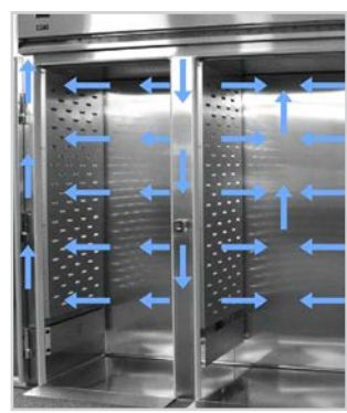
Unique air flow distribution ducts