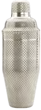
Stainless Steel M37205