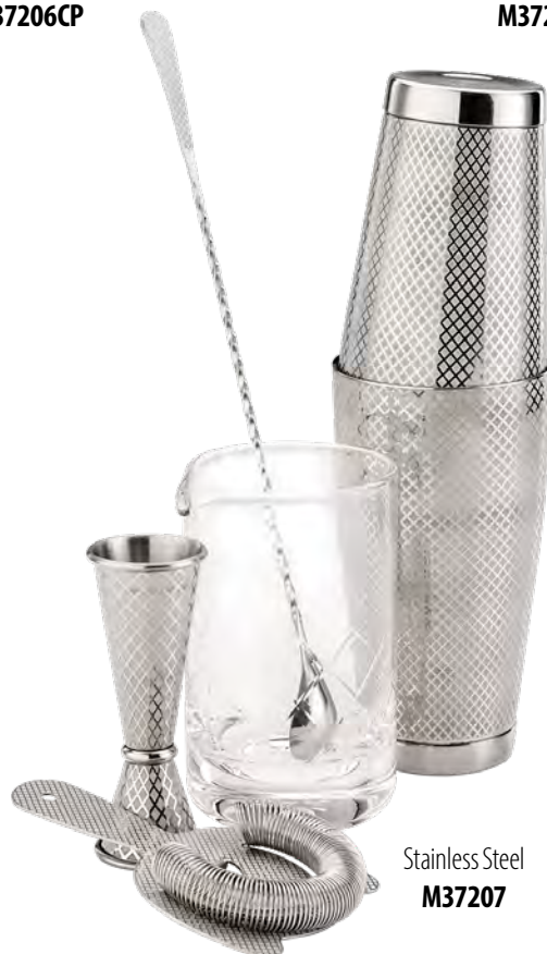
Stainless Steel M37207