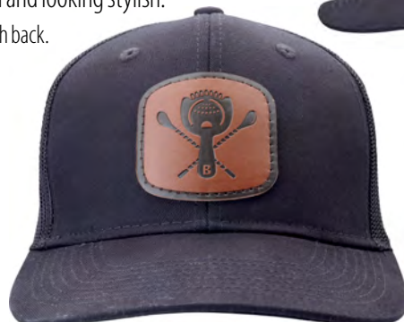
Black w/Black Mesh M60137BK