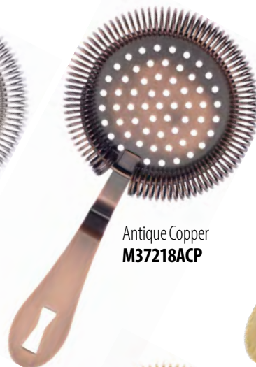
Antique Copper M37218ACP