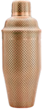
Antique Copper M37205ACP