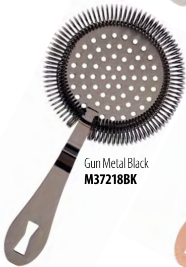
Gun Metal Black M37218BK