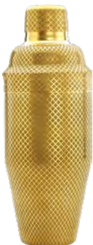
Gold Plated M37205GD