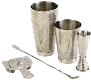
Stainless Steel M37206