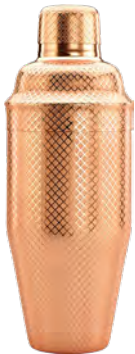
Copper Plated M37205CP