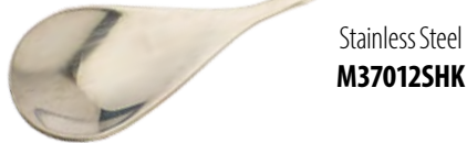
Stainless Steel M37012SHK