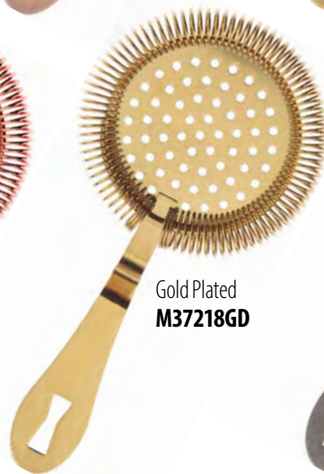
Gold Plated M37218GD