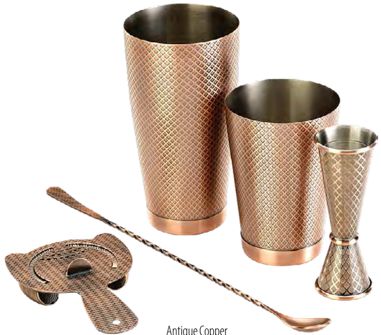
Antique Copper M37206ACP