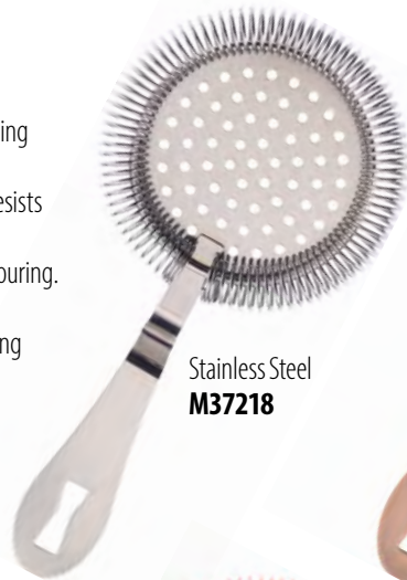
Stainless Steel M37218