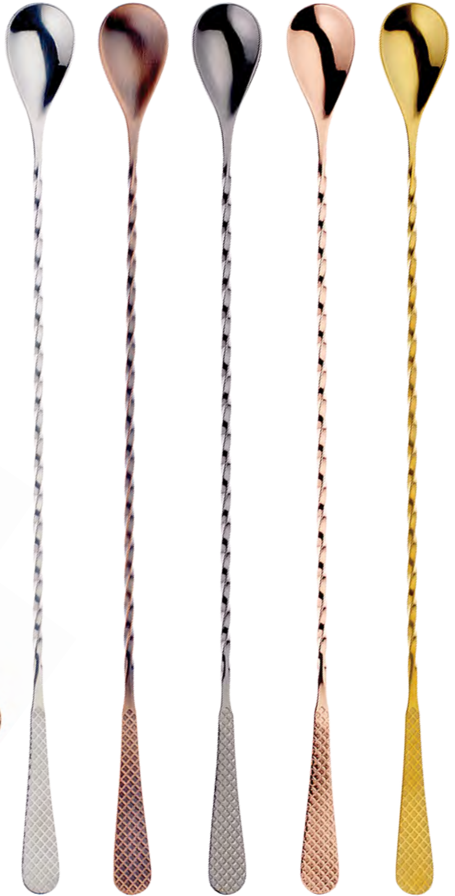
Stainless Steel M37204