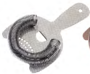
Stainless Steel M37203