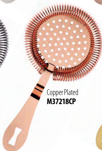
Copper Plated M37218CP