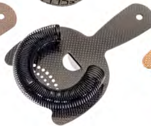
Gun Metal Black M37203BK