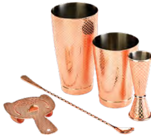
Copper Plated M37206CP