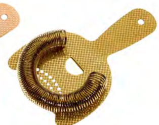
Gold Plated M37203GD