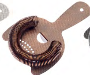
Antique Copper M37203ACP