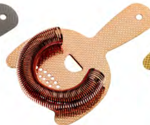
Copper Plated M37203CP