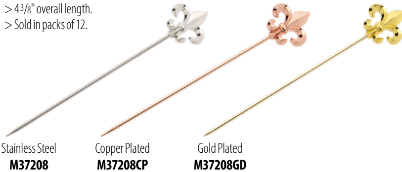
Stainless Steel M37208