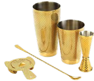
Gold Plated M37206GD