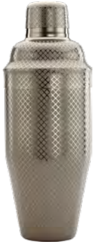
Gun Metal Black M37205BK