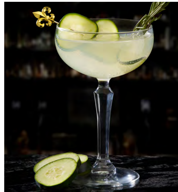
Gold Plated M37208GD