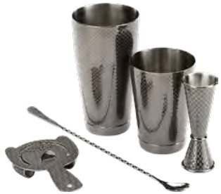
Gun Metal Black M37206BK