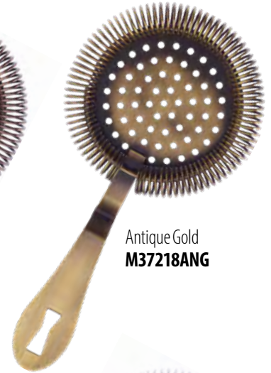
Antique Gold M37218ANG