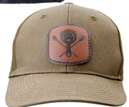
Khaki w/Khaki Mesh M60137KH